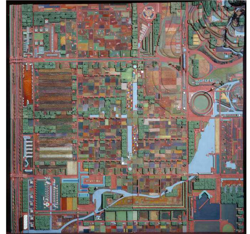
Frank Lloyd Wright's Broadacre City as a classic example of Physical Regional Planning